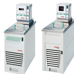
Bath/circulator Julabo F12 (left) and F25 (right) ref. T102MC, T102ME, T102ED

Bath/circulator, Julabo F 12-MA | ref. T102MC