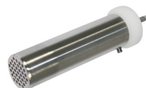
Powder wettability measuring device, steel ref. T112A