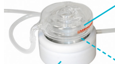
Gas phase temperature controller ref. T115 Sample vessel, diameter 70 mm ref. T104