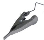
Sample holder for plates ref. T109RF

Single use aluminum tube hanged from balance hook. 10 pcs/bag.