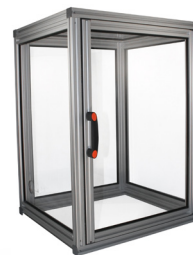
Cabinet ref. T140CAB

A transparent cabinet to protect the instrument from environment (e.g. air flow). Dimensions (mm): 772 height x 560 width x 510 depth