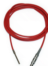
Temperature probe for Julabo F25ME ref. T102MT

PT-100 temperature probe and probe holder to enable standalone temperature control by the T102ME in the sample vessel.