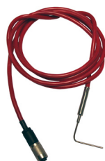
Temperature probe ref. T708

Pt-100 temperature measurement probe with holder (holder not shown here).