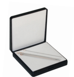
Sample holders for fibers ref. T111