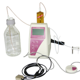
Dispenser for fully automatic CMC measurement ref. T101

Note: For synchronized dual dispenser operation for dilution CMC measurements of highly concentrated solutions, two dispensers are required.