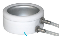
Thermostatic vessel from -10 to 100°C or from -20 to 200°C ref. T705 and T705A